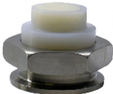
H6 KF-40 Sensor Housing