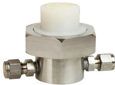
H3 Flow Through Sensor Housing